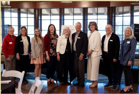
AAF Board of Directors